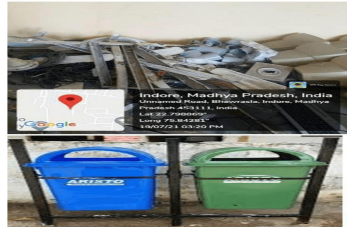
Solid waste management